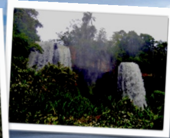
The Iguazú River begins its drop across the Iguazú Falls fault line.