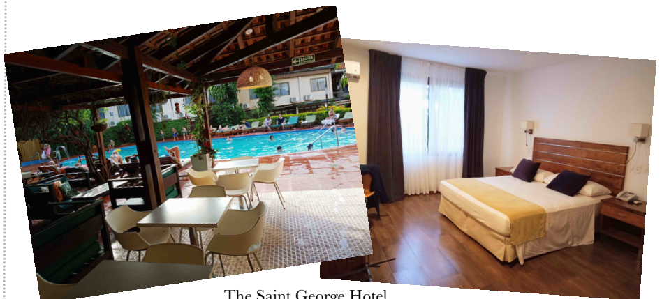
The Saint George Hotel

The two of us flew round trip from Buenos Aires and stayed two nights at the St. George Hotel. We arranged a taxi to take us from the airport into Puerto Iguazú, take us to the park and back and return us to the airport and with admission to the park our total cost (excluding food) was around US$700.