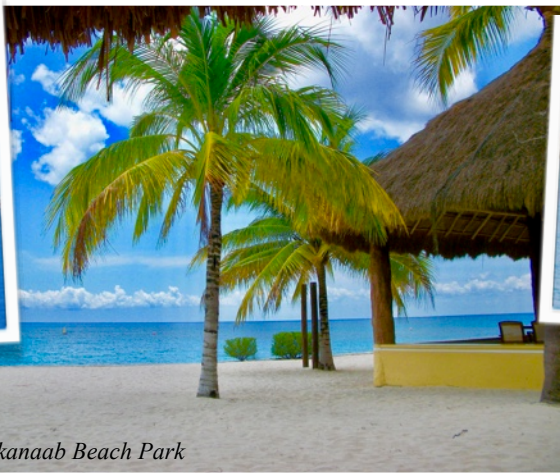
Chankanaab Beach Park