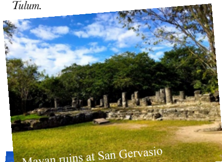
Mayan ruins at San Gervasio

Mayan ruins are within reach on Cozumel at San Gervasio and two hours south on the coast at Tulum.