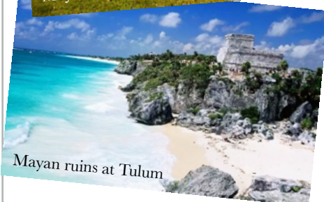
Mayan ruins at Tulum