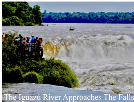
The Iguazú River Approaches The Falls

falls and it's only a short drive from the airport. All the remaining accommodations are about twelve to fifteen miles