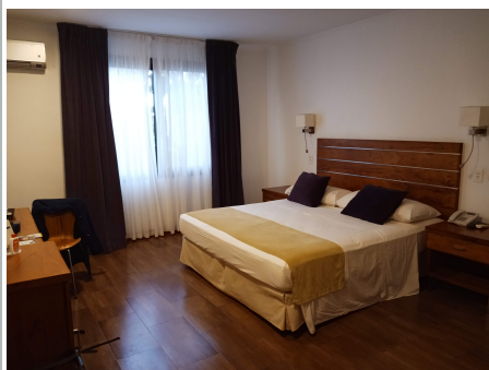
A Standard Room At The St. George

When you start planning your trip and begin reading reviews keep in mind that you are going to be visiting an isolated area and even four star ratings will most likely not rise to the level you've come to expect in the U.S. or Europe. After all it is an outpost of civilization a couple of hundred miles up into the South American rain forest. For that reason you should discount many of the negatives you read. We did and were generally pleased with this part of our trip.