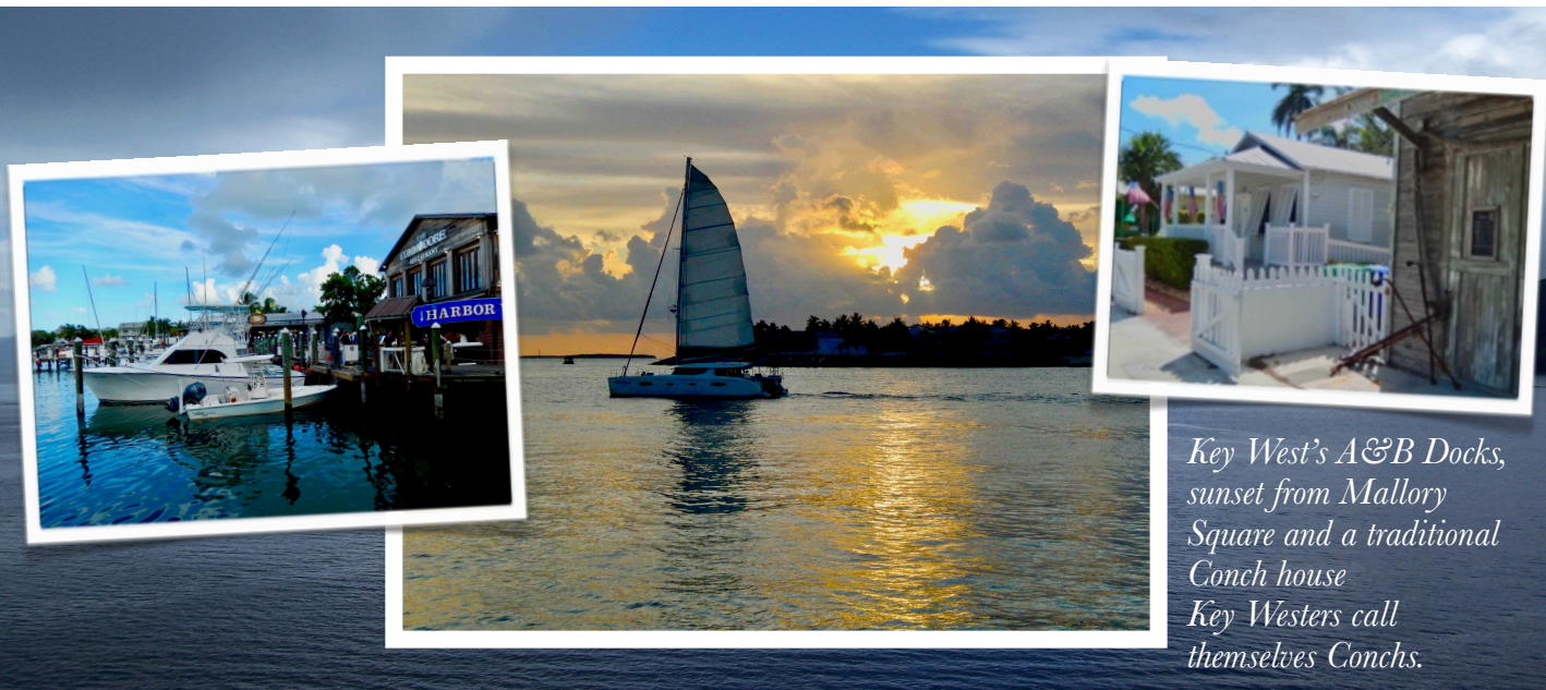
Key West's A&B Docks, sunset from Mallory Square and a traditional Conch house Key Westers call themselves Conchs.