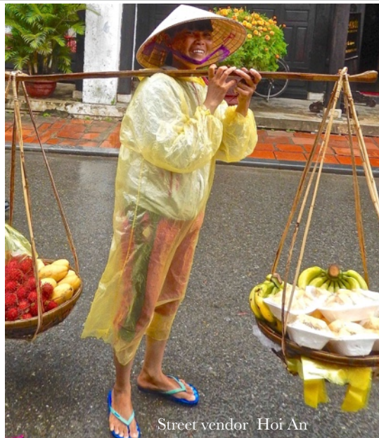
Street vendor Hoi An

Bà Nà Hill Station is resort area located in the Trường Sơn Mountains west of the city and features the longest cable car in the world along with a number of interesting attractions including The Golden Bridge a unique 450 foot pedestrian bridge. Located above 4,000 feet above sea level,