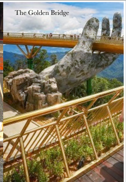
The Golden Bridge

it has views of the Sea and the surrounding mountains.