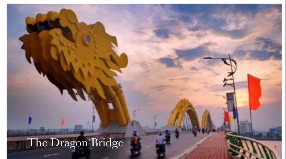
The Dragon Bridge

Danang Cathedral, Da Nang - Built in 1924 when Vietnam was under French control, the pink Gothic church stands above the city. In 1963, the church was officially recognized as Danang Cathedral. Behind the church is a grotto, fashioned after the Lourdes grotto in France.