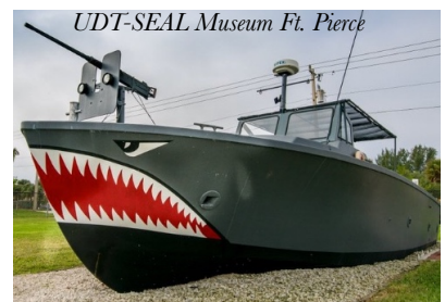
UDT-SEAL Museum Ft. Pierce