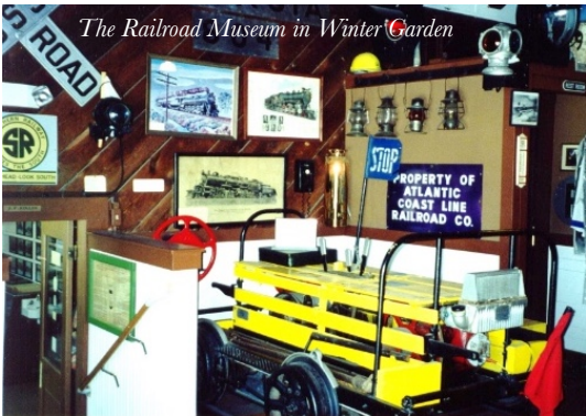
The Railroad Museum in Winter Garden

Just north of Disney World is Winter Garden, home to Florida's Railroad Museum, fun for railroad fans and children of all ages.