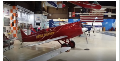
The Air Museum off I-4 between Orlando and Tampa

Ocala boasts Ft. King, an important outpost in the Seminole Wars, with a reconstruction and museum.