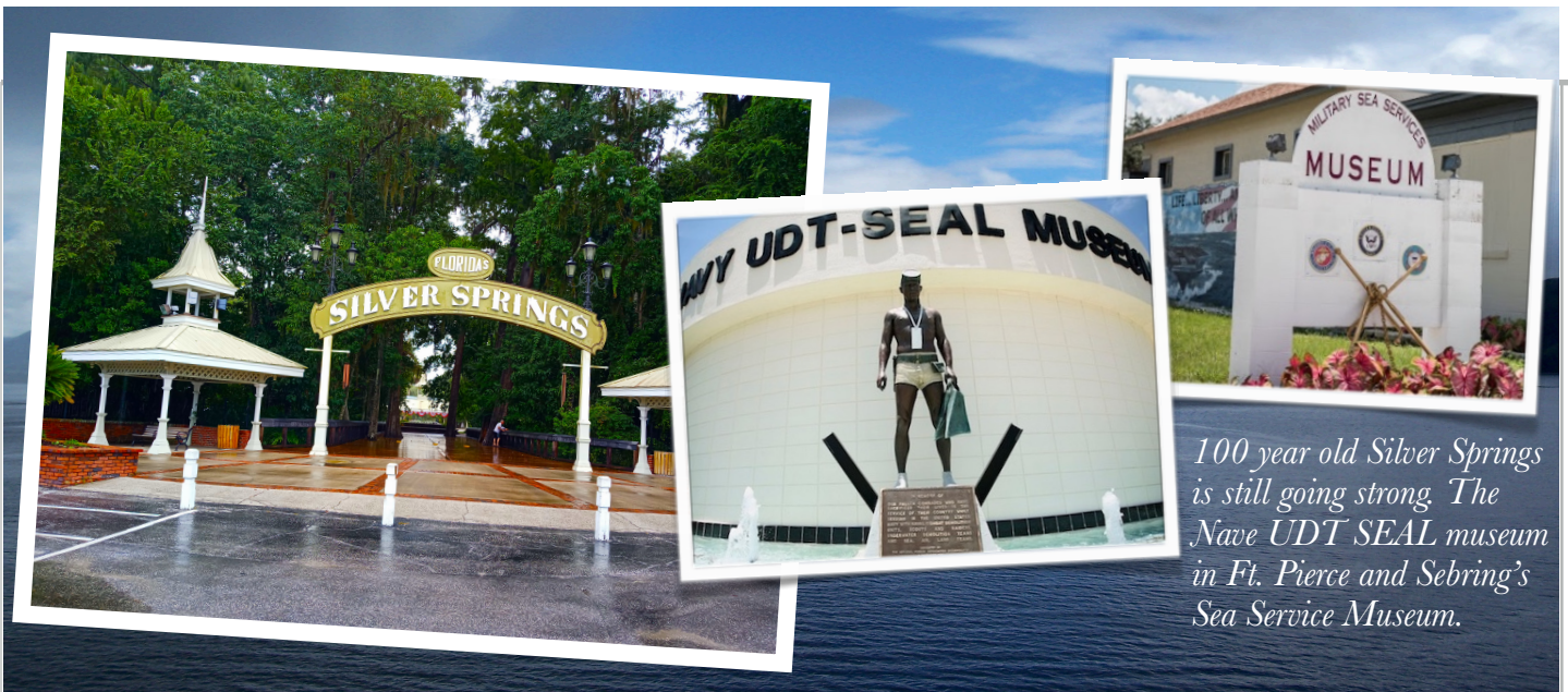
100 year old Silver Springs is still going strong. The Nave UDT SEAL museum in Ft. Pierce and Sebring's Sea Service Museum.

A FEATURE OF THE INTENTIONAL TRAVELER • INTEND2TRAVEL.COM • UPDATED NOV. 2019