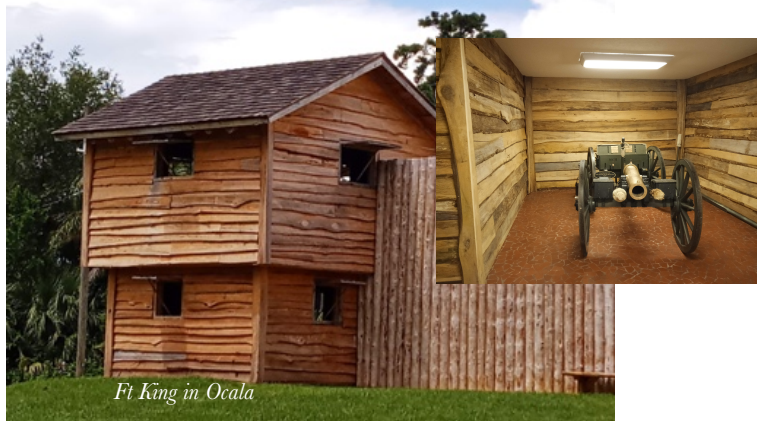
Ft King in Ocala