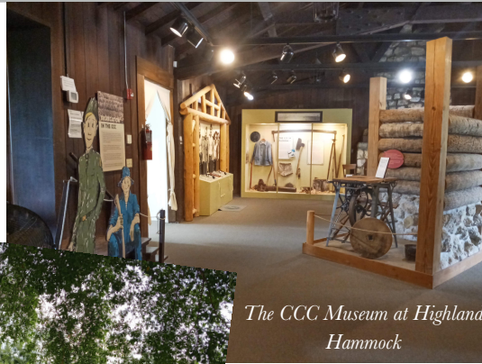
The CCC Museum at Highland Hammock

The Civilian Conservation Corps (CCC) was a voluntary public work relief program that operated from 1933 to 1942 in the United States for unemployed, unmarried men. For young men ages 18–25. Highlands Hammock State Park is home to the state of Florida's Civilian Conservation Corps (CCC) Museum. The park is one of eight original parks built by the CCC near Sebring Florida.