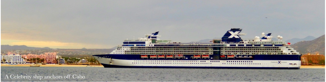
A Celebrity ship anchors off Cabo