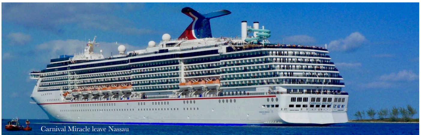
Carnival Miracle leave Nassau