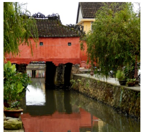
Japan Bridge in Vietnam

Cruises from Japan usually stop in ports in Japan, Korea, and Hong Kong before ending up in Singapore. West bound cruises from Singapore are usually headed to Dubai and normally will make port calls in Thailand, Sri Lanka, and India.