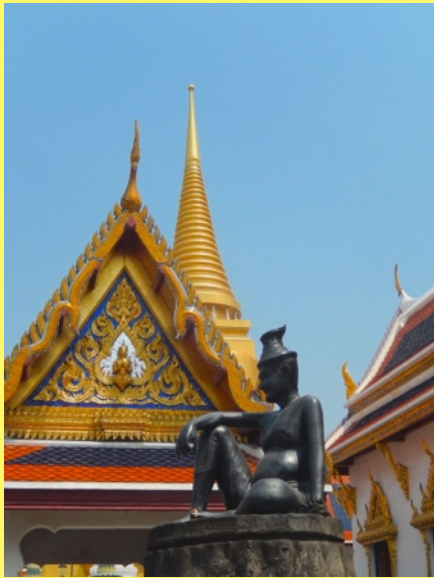
Bangkok Royal Palace grounds includes Wat Phra Kaew the home of the emerald Buddha .