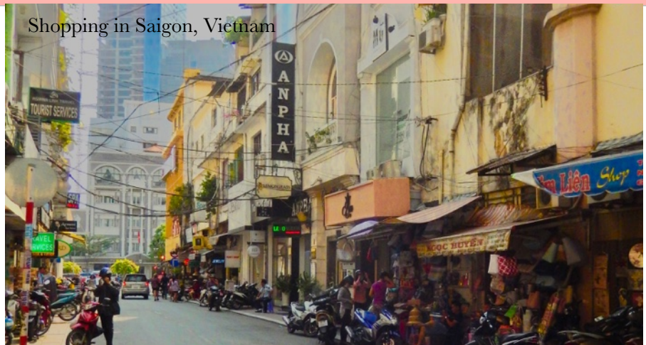
Shopping in Saigon, Vietnam

Thailand – A must on most cruises there are a number of ports but look for Bangkok (or its port of Laem Chabang). Bangkok is about an hours drive from the port but should not be missed. Many cruises overnight in Laem Chabang to provide more time in Bangkok.