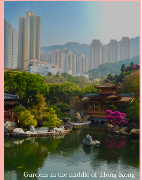
Gardens in the middle of Hong Kong

This is by far the most popular Asian itinerary with stops that can include Thailand, Vietnam, Hong Kong, the Philippines, Malaysia and at times Brunei, Taiwan, Cambodia and China. A large number of cruises are 14 days and start from Singapore circling the South China Sea. For a longer trip consider combining two cruises. Many itineraries run back to back with different ports on each cruise.