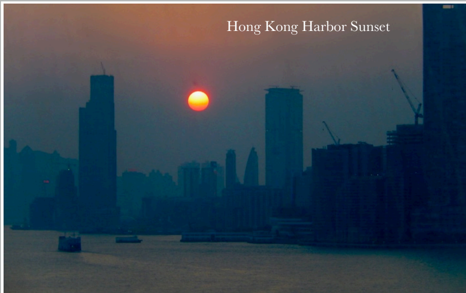
Hong Kong Harbor Sunset

Hong Kong – Like Singapore this is one of the worlds great cities with much to see and do. It is also a popular departure port for a number of cruises. If you're visiting Hong Kong be sure and study up on their metro system before you get there. It's inexpensive, clean and and an efficient way of seeing this city.