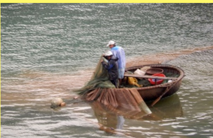
Fishermen in a basket boat in Vietnam.