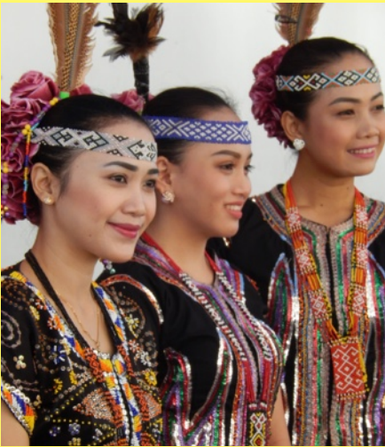
Tourist representatives greet a ship in Malaysia